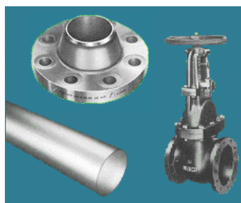
Stainless steel pipe, valves and fittings

We carry Stainless in both 304 and 316 grades-schedules 10 and 40. Our fittings are available in Butt weld and Threaded. Our Butt weld stock fittings are size 4" and below and our threaded