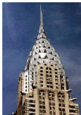
1930: The Chrysler Building's top seven arches are stainless steel clad. This New York City landmark is one of the world's most identifiable skyscrapers

Adding small quantities of chrome to the steel improves its resistance to the